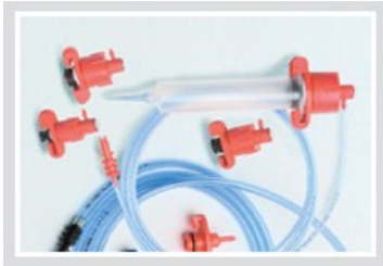
Syringe Adapters - Universal