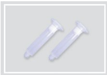
Syringes with Stoppers