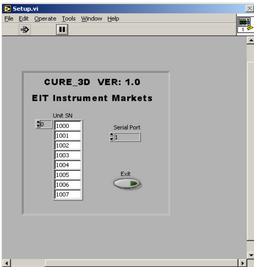
Figure 5. Software Set Up Screen

When adding additional sensors to the system for the first time, repeat this section