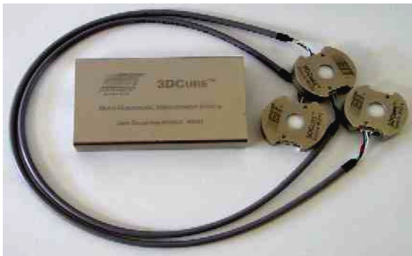
Figure 1. The 3DCURE™ Multi-Dimensional Curing Measurement System

The UV 3DCURE™ Multi-Dimensional Curing Measurement System integrates multiple UV sensors with a Data Collection Module (DCM). Sensors are placed at various locations on an object to collect UV energy data within a process system. The measurement system collects data through UV sensors and transmits that data to the DCM. Once UV measurement has taken place, UV energy density and peak irradiance data is transferred to a computer where it is displayed and can be monitored using the Cure_3D™ software.