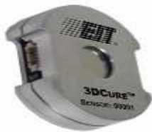
Figure 3. 3DCURE™ Sensor

Each sensor provided is a digital mini-radiometer with a single spectral bandwidth (identified by the decal on the sensor itself). The sensors are round with an optics window in the center. The two flattened insets house the cabling connectors and LED indicators. Necessary cabling is provided to link the sensors to the DCM and other sensors in the system chain.