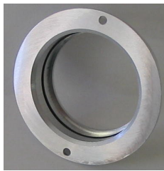
Figure 4. Sensor Positioner

The 3DCURE™ System kit is provided with mounting hardware for the sensors. Other mounting options can also be used (see "Other Mounting Options").