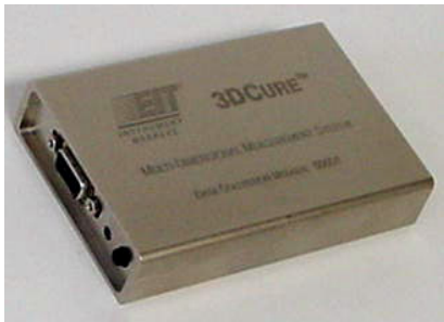
Figure 2. Data Collection Module (DCM)

The 3DCURE™ System's Data Collection Module (DCM) is a portable, battery powered unit that travels with the sensors as they are exposed to UV energy. Data is transferred to the PC by connecting the DCM to the PC. The DCM's pushbutton controls the primary functions of the system and the LED indicator notifies the user of the system's status.